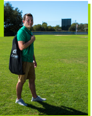
Convenient Carrying Bag Included for Easy Transportation and Storage