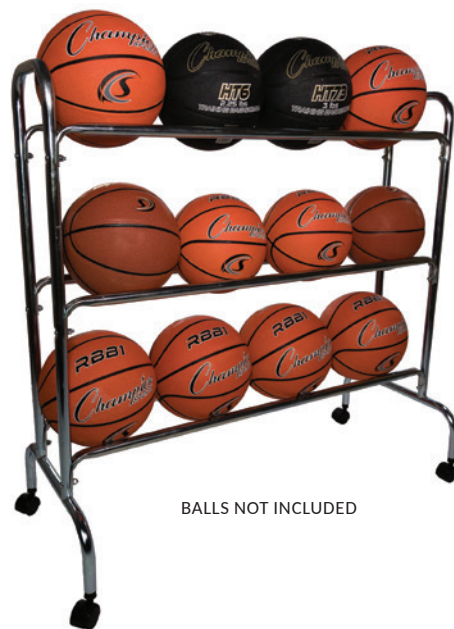
BALLS NOT INCLUDED