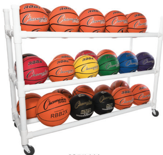
Balls Not Included